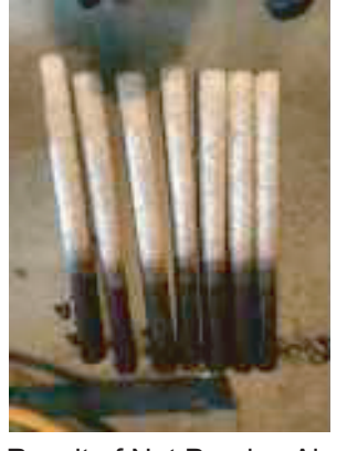
Result of Not Purging Air

· Drain fluid from housing when servicing.