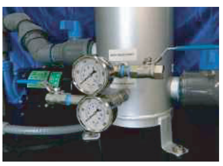
Pressure Gauges & Drain Valves

Pressure Gauges on the inlet and outlet of the filter housing are used to determine when the cartridges are dirty and need to be replaced.